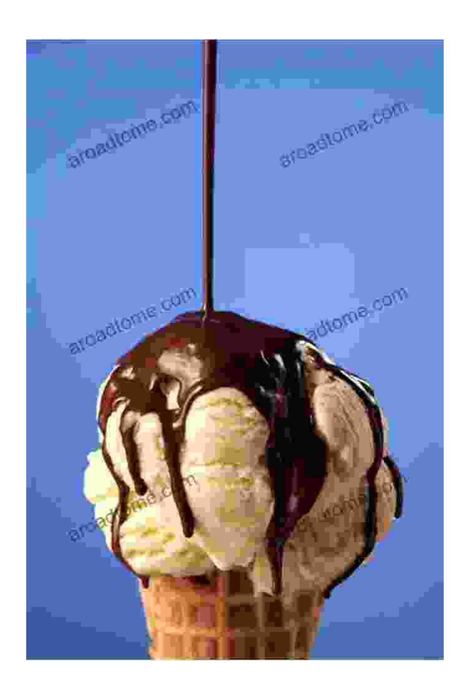
The Ice Cream Queen of Orchard Street: A Novel