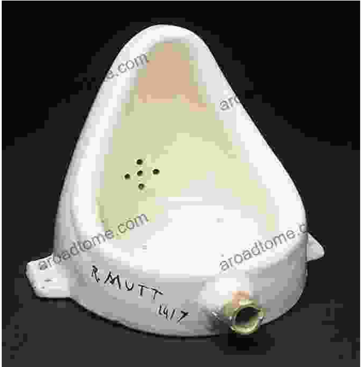
Marcel Duchamp, 'Fountain', 1917