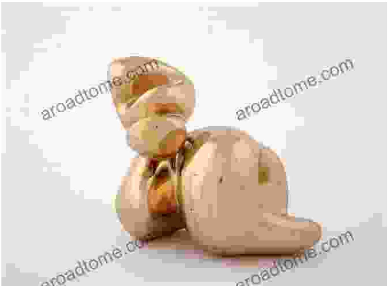
Jean Arp, 'Head and Tail', 1928

work was often influenced by Dadaism and Surrealism, and he was a key figure in the development of these movements.