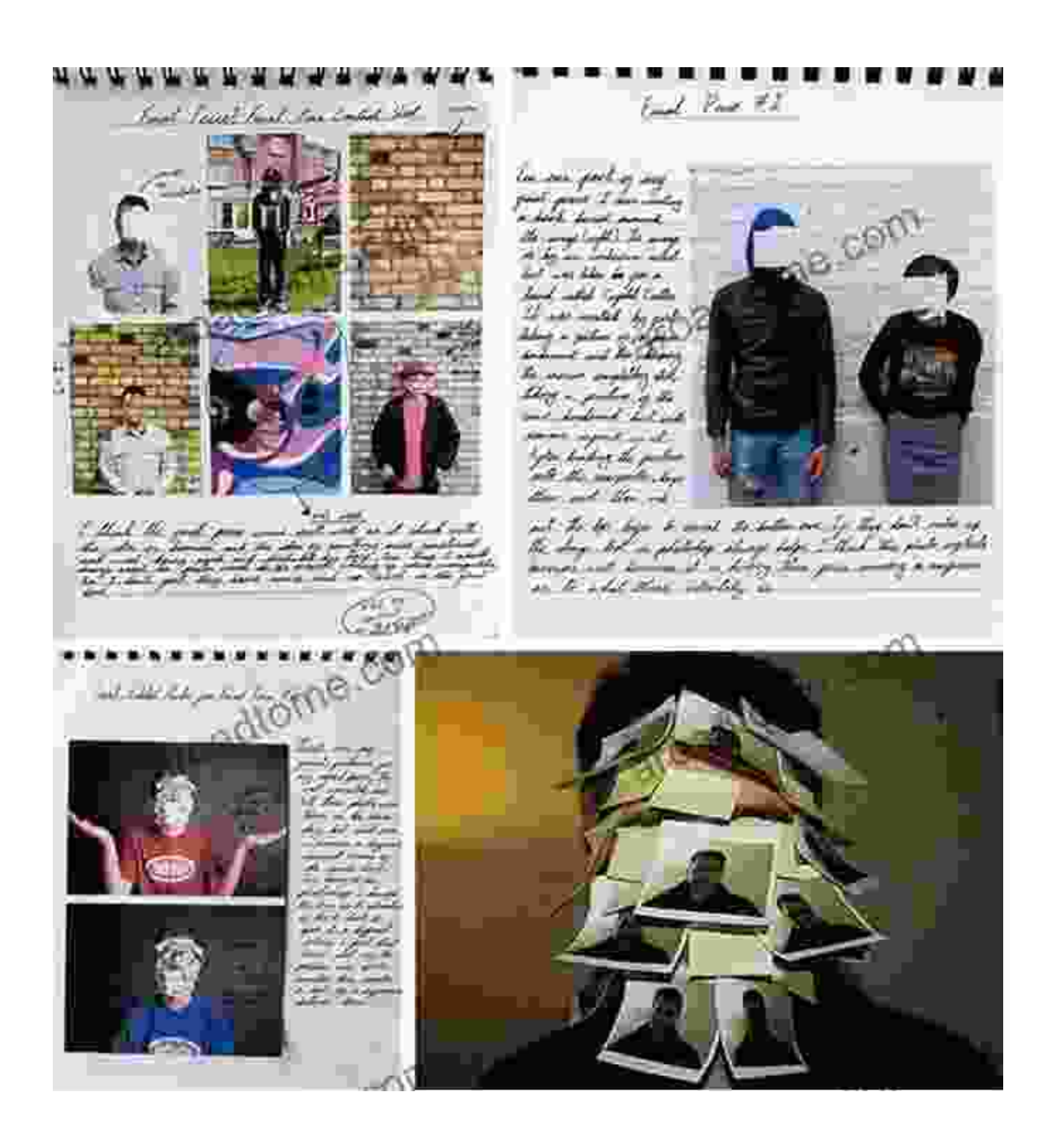
Unveiling the World Through the Lens: A Journey of Visual Exploration