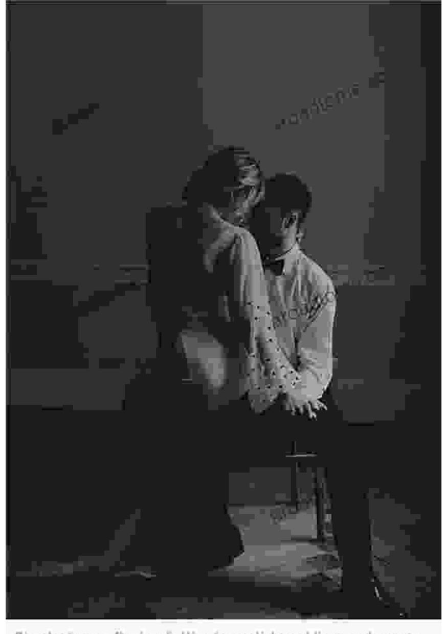
Blonde Army - Design & Hire for stylish weddings and events